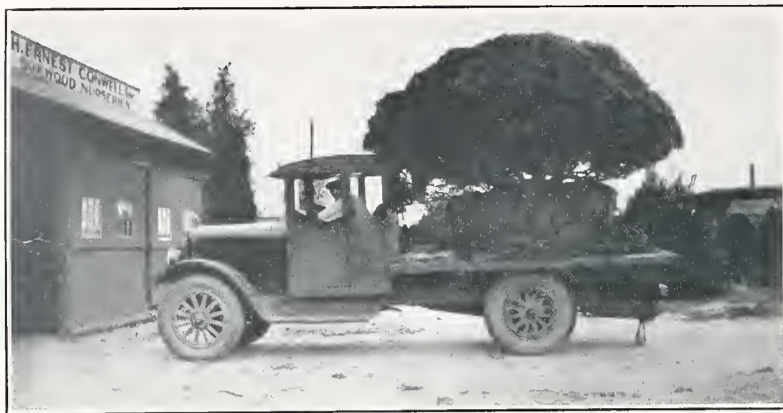
LARGE SUFFRUTICOSA SPECIMEN OF PERFECT FORM BEING MOVED IN NURSERY IT'S HERE NOW!